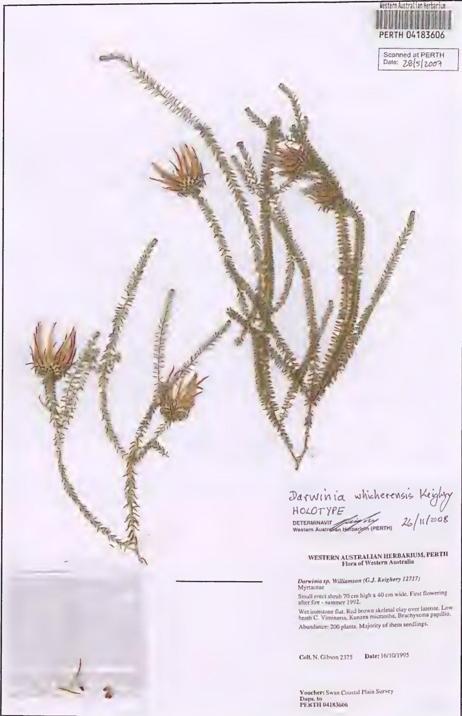
Figure 5. Holotype of Darwinia whickerensis , scale bar = 5 cm.